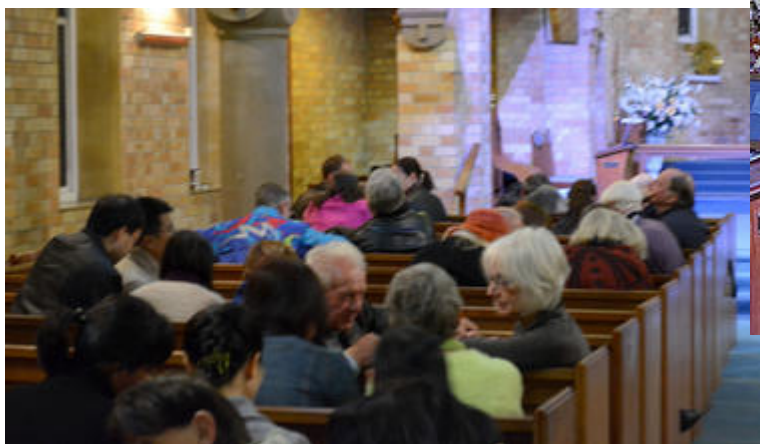
Attendees split into groups to pray throughout the night

Leaders from St John the Evangelist Church read John 14:15-20 in English and Chinese. Worship songs were played beautifully on the night by a Chinese couple from St John's; their voices lifted up the spirit of every person attending the evening - it was heaven on earth.